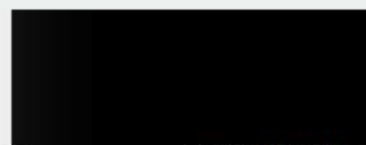
A GM: WA0848 Tuxedo Black

refinish paint codes (PPG, Dupont, Acme Rogers, Martin Senour, Sherwin Williams)