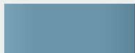
D GM: WA3301 Mist Blue

PPG: 50700 Dupont: 4624LH,181-97213M Acme Rogers: 9666 Sherwin Williams: 2429 RM- BASF: A1711M