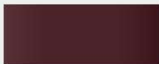
N GM: WA3307 Madeira Maroon

PPG: 8259 Dupont: 4024L,93-93774 Acme Rogers: 8857 Martin Senour: 1427 Sherwin Williams: 5845 RM- BASF: A1199