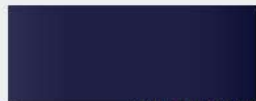
E GM: WA3302 Danube Blue

PPG: 71472 Dupont: 4625LH,93-97540H Acme Rogers: 9668 Sherwin Williams: 9531 RM- BASF: A1712M