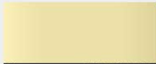
Y GM: WA3494 Lemonwood Yellow

PPG: 43364 Dupont: 4628L,181-97217 Acme Rogers: 9664 Sherwin Williams: 2423 RM- BASF: A1718