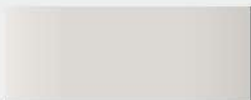
C GM: WA2661 Ermine Ivory

PPG: 50700 Dupont: 4624LH,181-97213M Acme Rogers: 9666 Sherwin Williams: 2429 RM- BASF: A1711M