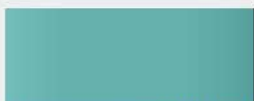
K GM: WA3305 Artesian Turquoise

PPG: 22270 Dupont: 4401L,93-96261 Acme Rogers: 9188 Sherwin Williams: 8039 RM- BASF: A1530