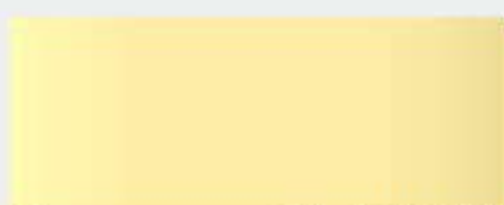
Y GM: WA3313 Crocus Yellow

PPG: 13003 Dupont: 4629L,181-97218 Acme Rogers: 9665 RM-BASF: A1719