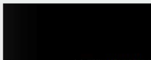
A GM: WA0848 Tuxedo Black

model year code manuf code Promotional Color Name