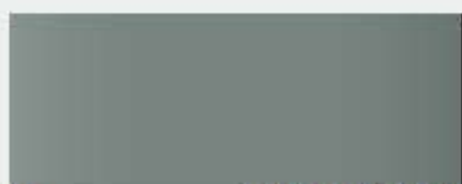
H GM: WA3303 Willow Green

PPG: 71472 Dupont: 4625LH,93-97540H Acme Rogers: 9668 Sherwin Williams: 9531 RM- BASF: A1712M