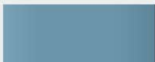
D GM: WA3301 Mist Blue

PPG: 50693 Dupont: 4632L,181-97221 Acme Rogers: 9666 Sherwin Williams: 2436,35420 RM-BASF: A1722